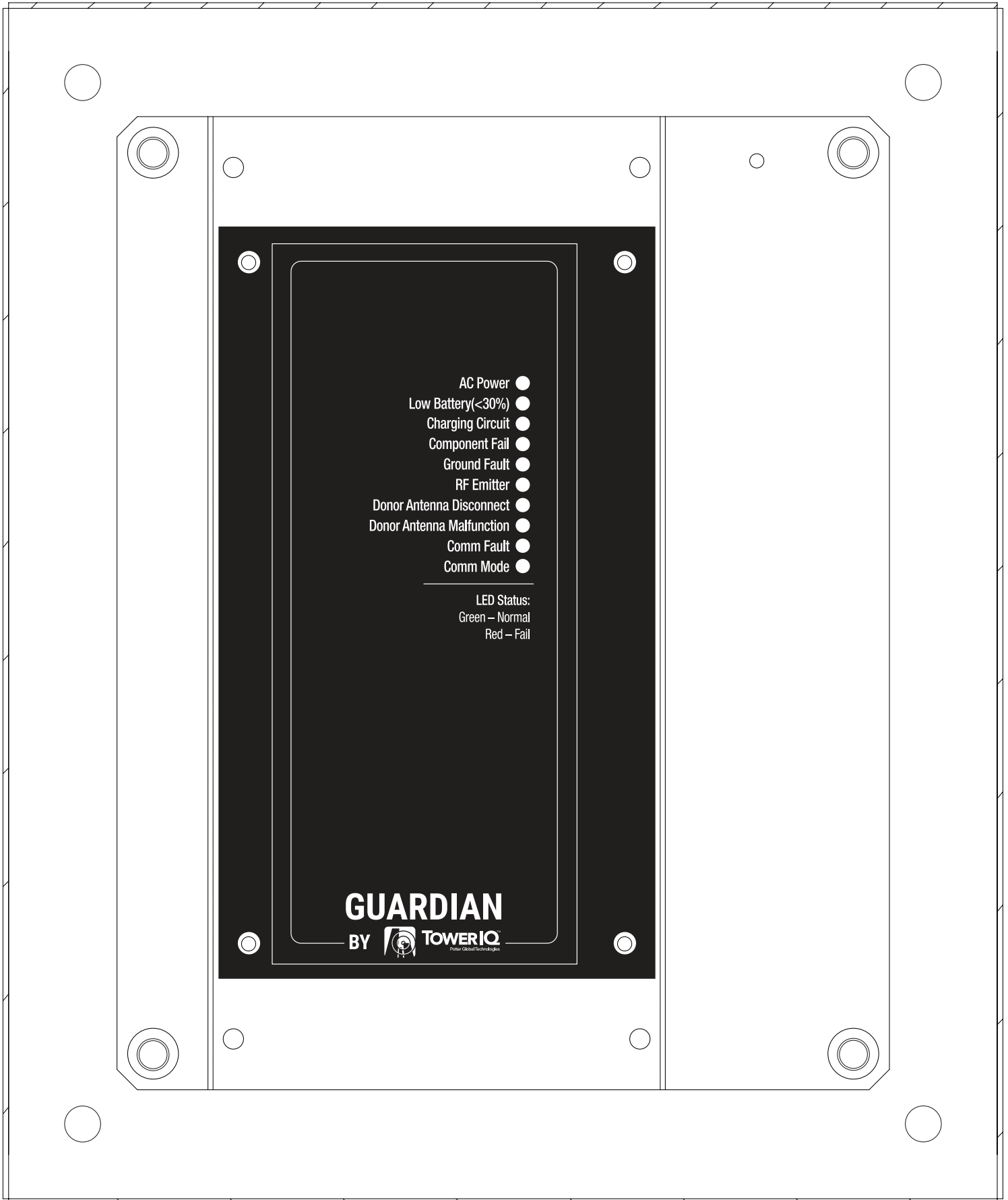
Fig 2 Guardian Annunciator